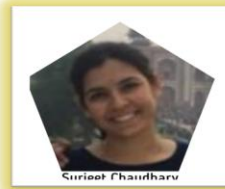
Surismit Ghaurharav ( IAS )