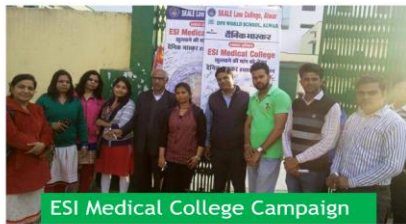
ESI Medical College Campaign