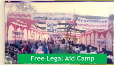
Free Legal Aid Camp