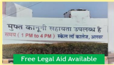
Free Legal Aid Available