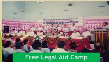
Free Legal Aid Camp